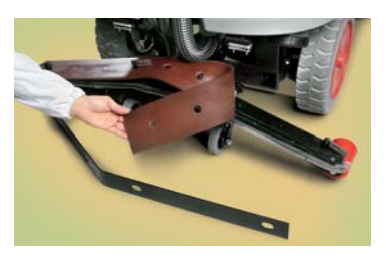
Removing the squeegee rubbers is extremely simple. Just open the hinged clamp with a hammer to easily pull out the rubber

The solution hose connection with level floating ensures easy filling into the solution tank (optional)