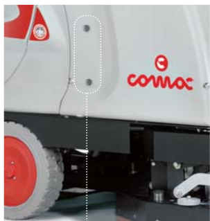
Liquid level indicators (version with CDS)

The dashboard is easy to read and within easy reach of the operator to allow total control of every working phase. The electronic system - accessible through a lift-up panel from the front - controls every scrubbing phase. Thanks to the self-test system every anomaly can be identified so that technical service times are considerably reduced