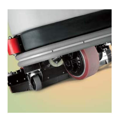
The powerful drive wheel ensures total safety. Ultra 85/100 has anti-slide wheels, speed reduction around bends, traction with control in A.C. and a watertight carbon brush-less motor all as standard features

When the traction stops, the brushes stop turning and no more water is supplied.