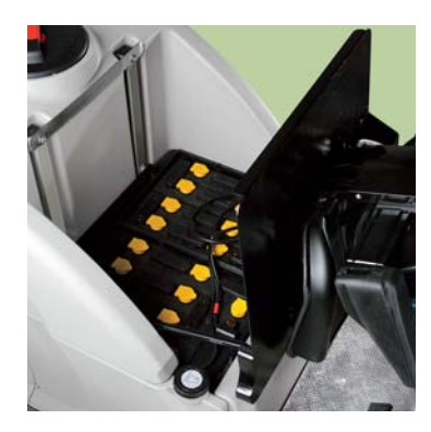
36 Volt electrical system. The large opening of the battery compartment ensures excellent accessibility and easy accommodation of the battery pack